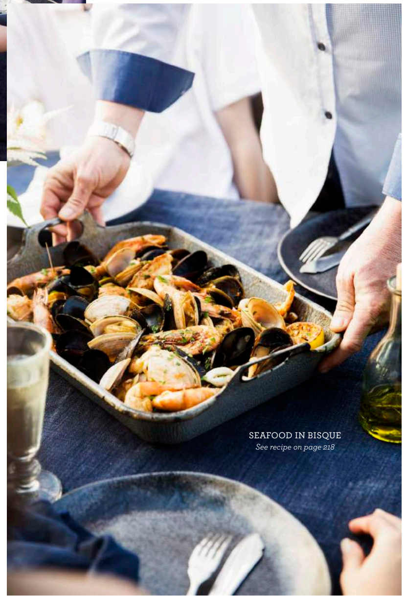
SEAFOOD IN BISQUE See recipe on page 218