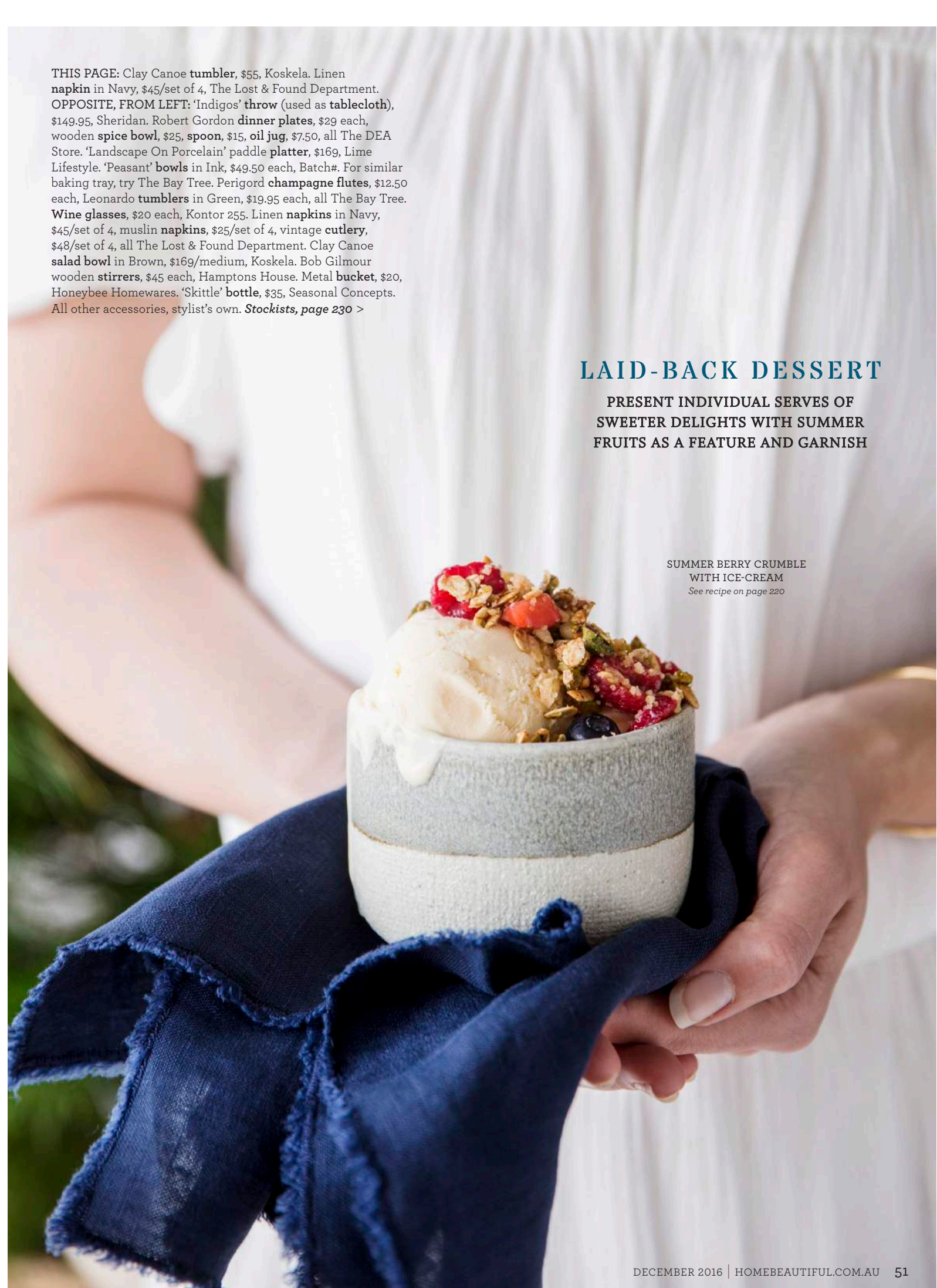
SUMMER BERRY CRUMBLE WITH ICE-CREAM See recipe on page 220

PRESENT INDIVIDUAL SERVES OF SWEETER DELIGHTS WITH SUMMER FRUITS AS A FEATURE AND GARNISH