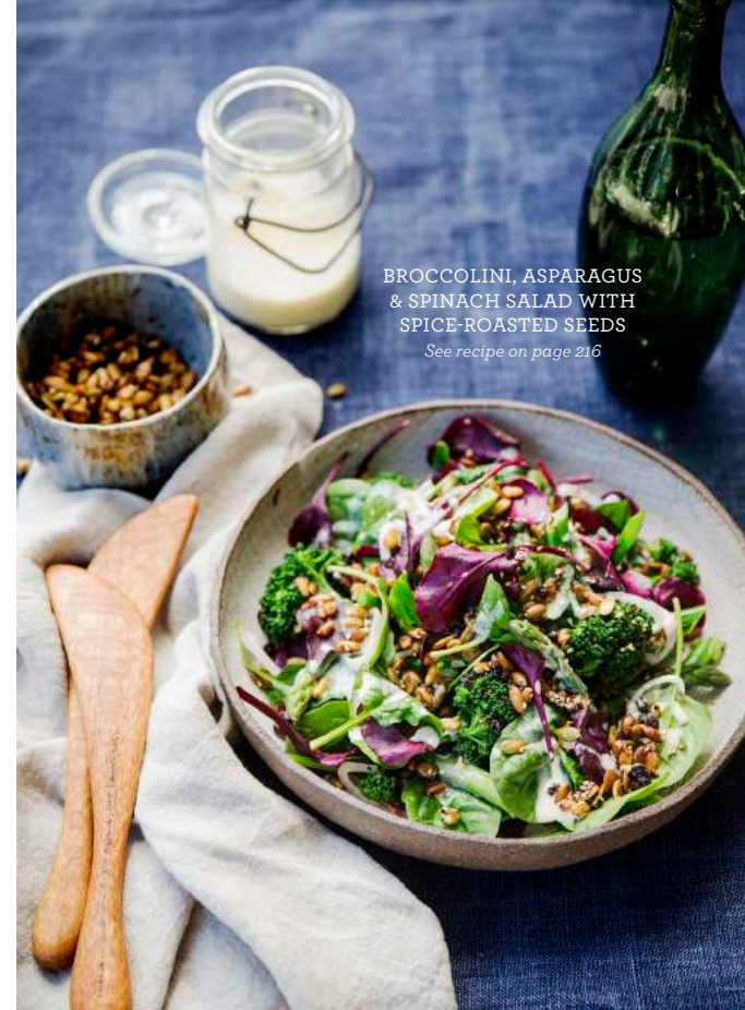
BROCCOLINI, ASPARAGUS & SPINACH SALAD WITH SPICE-ROASTED SEEDS See recipe on page 216