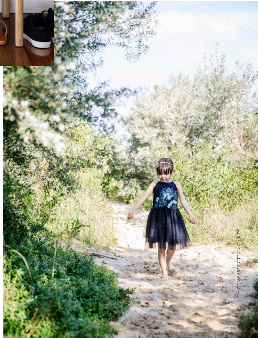
CHLOE WEARS COTTON ON KIDS

ABOVE, FROM LEFT: 'Snow Fawn' Santa sack, $69.95, The Woodsfolk. 'Jana' long bench in Nude, $1320, MRD Home. 'Indigos' throw, $149.95, Sheridan. Cow bells, $240, Kontor 255. 'Shade' side plate, $12.95, and cup, $9.95, in Sage, both Salt & Pepper. 'Celia' crossover slides, $99.95, Country Road. Canvas sneakers, $39, Target. Striped stockings in Taupe, $68 each, Papier D'Amour. 'The Boater' raffia hat, $69.95, Witchery. Uashmama 'Lux' tote, $199, The Design Hunter. 'Wonderful' denim bag, $189, Pony Rider. Green straw hat, stylist's own. TOP CENTRE, FROM LEFT: Top shelves: Small vintage books, $59 each, large vintage books, $140/set of 2, all Maison Et Jardin; 'Seeder' candle holder, $60, The Design Hunter; 'Midnight Feather' wreath, $79.95, The Woodsfolk; Chinese temple jar, $195, My Island Home; wire Ferris wheel ornament, $8, My Brother Albert; brass vintage bells, $40 each, The Design Hunter; 'Lalita' feather crown, $199, Losari. Bottom shelves: Brass fruit basket, $49.95, The Design Twins; brass candlestick, $85, Kontor 255; for similar Chinese paintbrushes, try Lumu Interiors; Vietnamese ceramic jar, from $45, vintage soda bottle $165, 'Benin' bronze cuff, $195, all Lumu Interiors; brass chai pot, $90, The Design Hunter; German jar, from $75, Kontor 255. All other accessories, stylist's own.