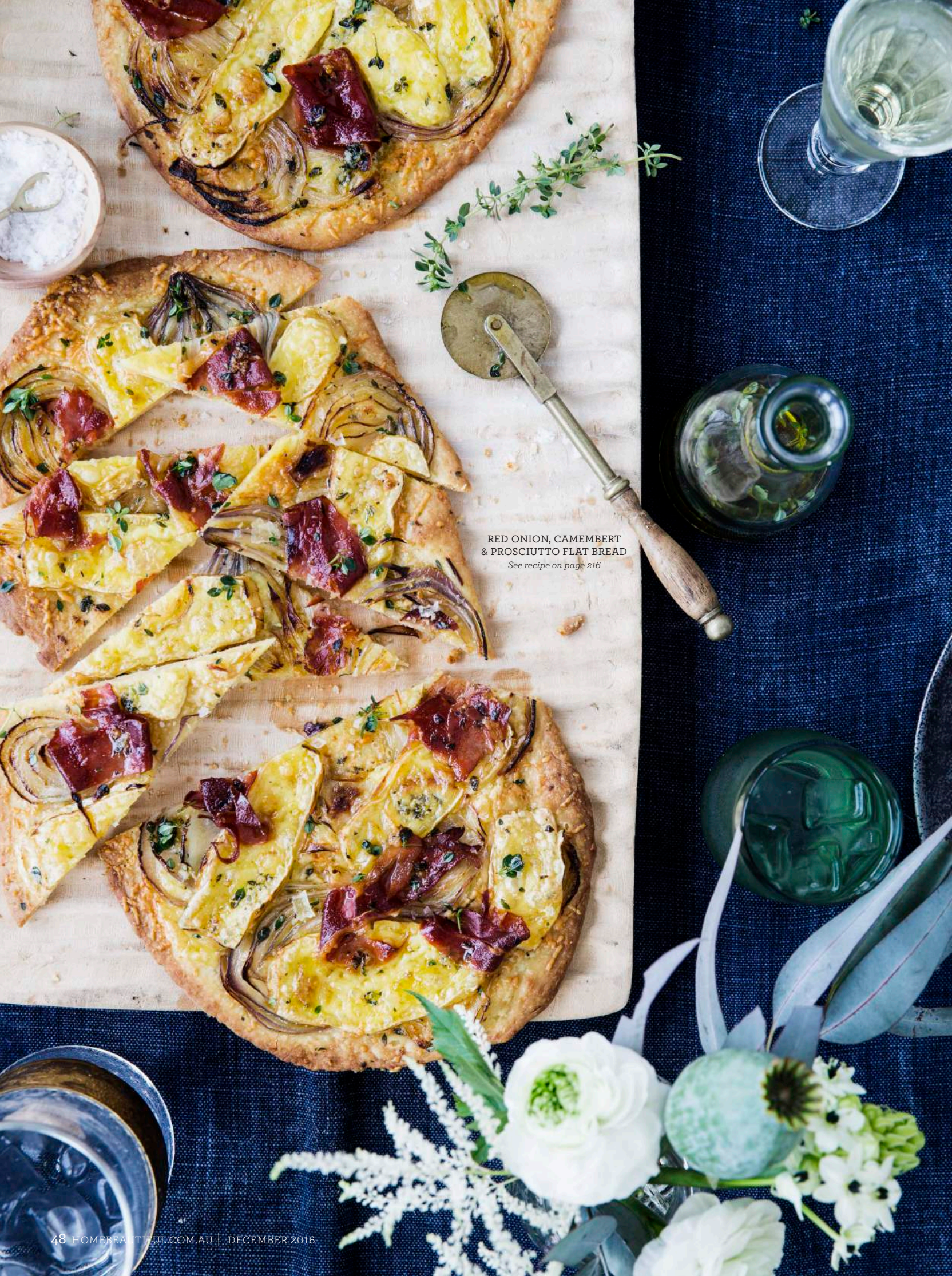
RED ONION, CAMEBERT & PROSCIUTTO FLAT BREAD See recipe on page 216